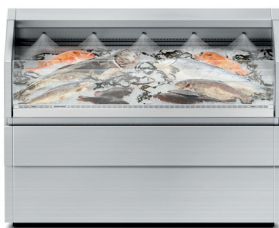
Optional misting system