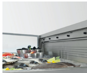
Spray bar nozzles