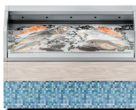
Customizable cladding and materials