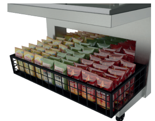
Cross-selling basket (optional)