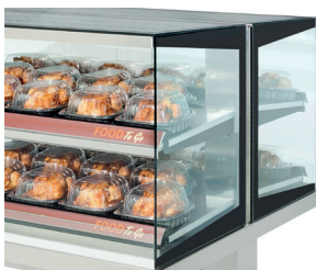
Optimum product visibility