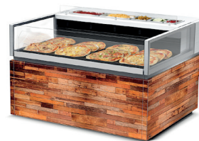
Customizable cladding and materials