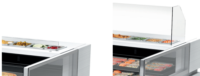
Low or high glass panel in front of ingredients