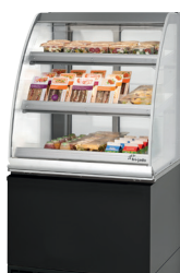
MC 75 Cold Curved