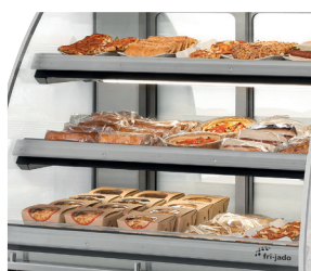
Three presentation levels