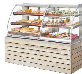
Various combinations possible