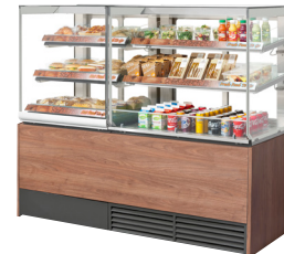
Various combinations possible