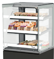
MC 100 Cold Square