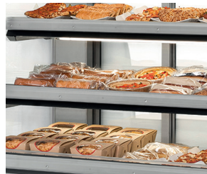
Three presentation levels