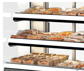
Three presentation levels