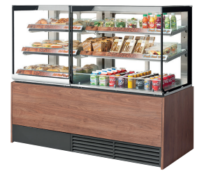
Various combinations possible