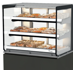
MC 40 Hot Square