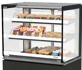
MC Square with doors