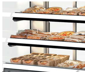
Three presentation levels