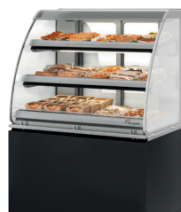
MC 100 Hot Curved