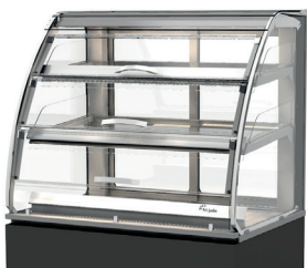
MC Cold Curved self-serve