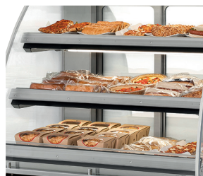
Three presentation levels