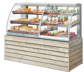
Various combinations possible