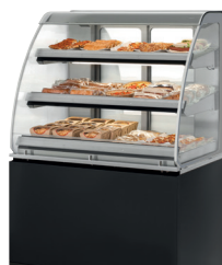
MC 40 Hot Curved