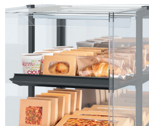
Food (literally) in the spotlights - LED lighting above each shelf.