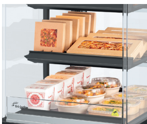
Ultimate product visibility - transparent design, thin shelves, no distraction.