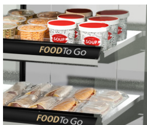
Optimum product visibility