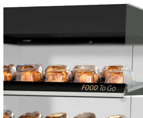
Stylish black canopy