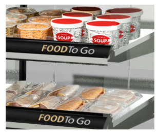
Optimum product visibility