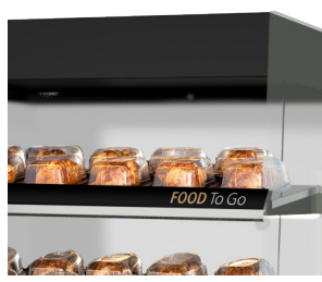
Stylish black canopy